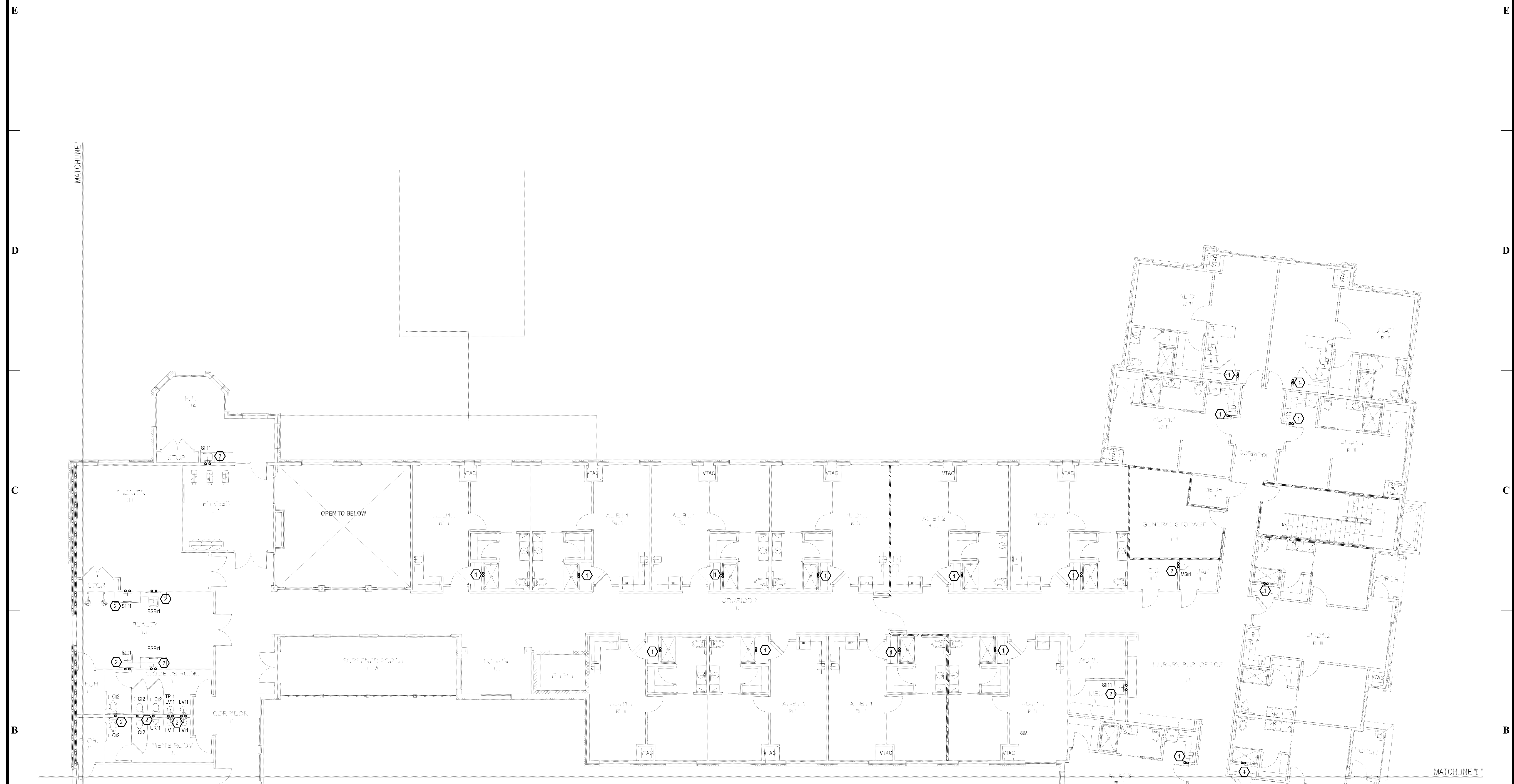
1 | SECOND FLOOR PLUMBING LATER PLAN P2.2.1 1/8" = 1'-0"