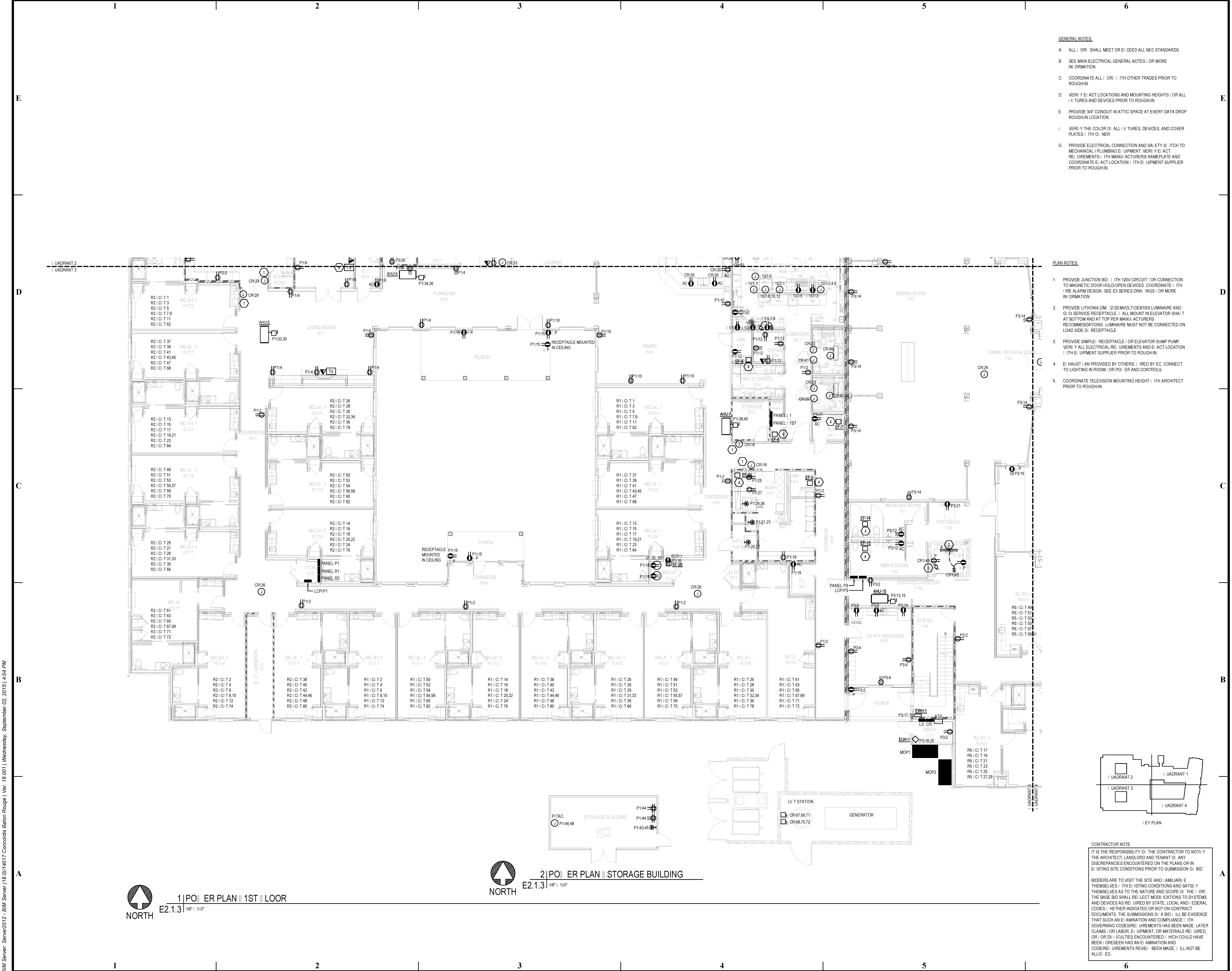
2 | POER PLAN | STORAGE BUILDING E2.1.3 | 18" x 110"

CONTRACTOR NOTE: IT IS THE RESPONSIBILITY OF THE CONTRACTOR TO NOTIFY THE ARCHITECT, LANDLORD AND TENANT OF ANY DISCREPANCIES ENCOUNTERED ON THE PLANS OR IN EXISTING SITE CONDITIONS PRIOR TO SUBMISSION OF BID. BIDDERS ARE TO VISIT THE SITE AND FAMILIARIZE THEMSELVES WITH THE EXISTING CONDITIONS AND SATISFY THEMSELVES AS TO THE NATURE AND SCOPE OF THE WORK. THE BASE BID SHALL REFLECT MODIFICATIONS TO SYSTEMS AND DEVICES AS REQUIRED BY STATE, LOCAL AND FEDERAL CODES. WHETHER INDICATED OR NOT ON CONTRACT DOCUMENTS. THE SUBMISSION OF A BID WILL BE EVIDENCE THAT SUCH AN EXAMINATION AND COMPLIANCE WITH GOVERNING CODES/REQUIREMENTS HAS BEEN MADE. LATER CLAIMS OR LABOR, EQUIPMENT, OR MATERIALS REQUIRED, OR CORRECTIONS ENCOUNTERED WHICH COULD HAVE BEEN FORESEEN HAD AN EXAMINATION AND CODE/REQUIREMENTS REVIEW BEEN MADE, WILL NOT BE ALLOWED.