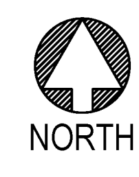
1 | LIGHTING PLAN | 2ND | LOOR E1.2.4 | 1/8" = 1'-0"

BIM Server: Server2012 - BIM Server (18/07/14017 Concordia Baton Rouge) [Ver: 18.001] Wednesday, September 02, 2015 | 4:04 PM