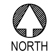
1 | LIGHTING PLAN | 2ND | LOOR E1.2.1 | 1/8" = 1'-0"

BIM Server: Save/2012 - BIM Server (18/01/14)17 Concordia Baton Rouge | Ver: 18.0011 | Wednesday, September 02, 2015 | 4:04 PM