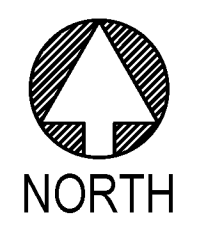
1 | LIGHTING PLAN | 1ST FLOOR E1.1.4 1/8" = 1'-0"

BIM Server: Save/2012 - BIM Server (18/01/14)17 Concordia Baton Rouge | Ver: 18.0011 | Wednesday, September 02, 2015 | 4:04 PM